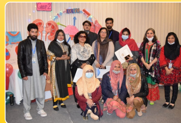
Pathophysiology model's presentation,BSN Year II,Semester III