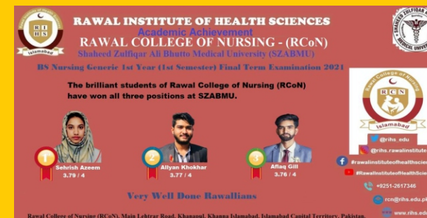
Postion Holders (SZAMBU),BSN , Semester I,2021