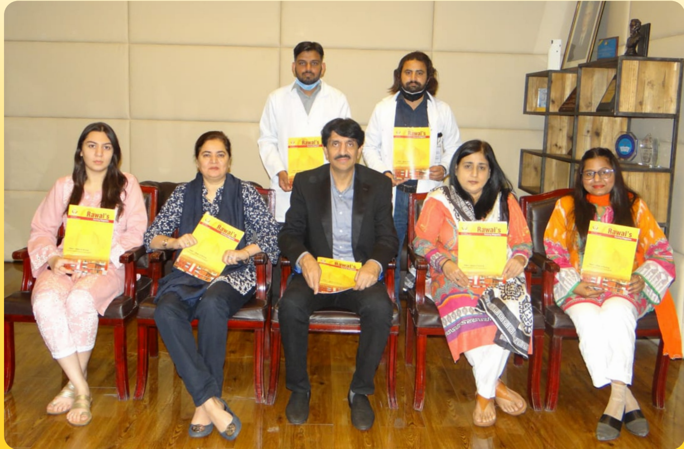
The magazine team with top management