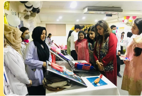
Anatomy & Physiology Exhibition,BSN Year-I, Semester-I