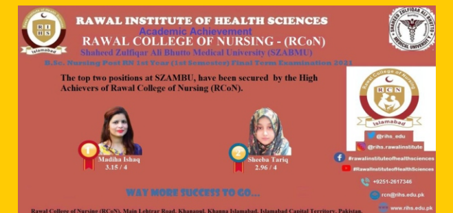
Postion Holders(SZAMBU), Post RN,Semester I,2021 (1)