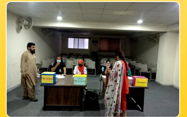
Student body Election,2021 (1)